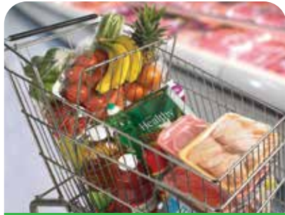
Separate Raw Meat, Poultry, Seafood and Eggs from Other Foods