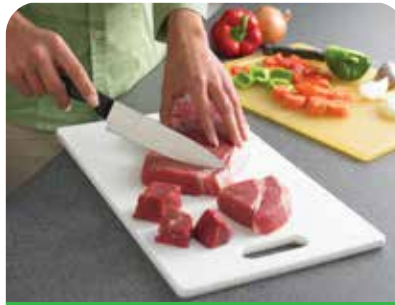
Use Separate Cutting Boards, Plates and Utensils